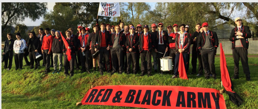
Student supporter group, Rostrevor Casual Element, cheering our First XI to victory at last week's home game.

E roscol@rostrevor.sa.edu.au W www.rostrevor.sa.edu.au