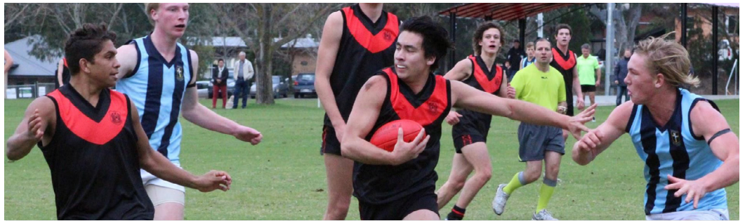
First XVIII Football, Rostrevor defeated Immanuel College last weekend in front of a home crowd.