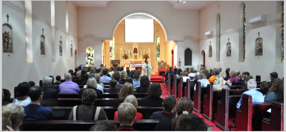
Chapel of St Joseph , Year 6 Celebration

We are in the season of Advent which is a time of waiting and preparation for Christmas. In the chapel here at the College we have set up an Advent wreath. The wreath is made up of a circle of green leaves and branches which represents God's never ending love for his people. There are four candles around the circle, one for each Sunday of advent. The first is the prophets' candle, a reminder of all those who foretold the coming of Jesus. Candle two is the Bethlehem candle named after the place of Christ's birth. The third candle is rose coloured and is the shepherds' candle because they made known to all the news of Christ's birth. Finally the fourth is the angel's candle a special reminder of how God announced the coming of Jesus. Each week a further candle is lit as the lead up to Christmas.