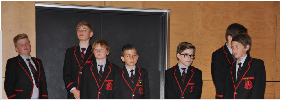
Rite of passage , Yr 6 Boys before they are presented during their ceremony Thursday

Our Graduation ceremonies are great celebrations marking the end of compulsory schooling for our Year 12 students. It is wonderful to see students and their extended families so happy, so proud and probably, so relieved that it is all over! Not a single young man graduates from Rostrevor without significant sacrifice by himself and his support network, which in most cases includes his parents or carers. We say “thank you” to parents and carers for your trust and support of Rostrevor throughout this journey.