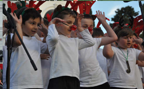
Junior Years Carols by Candlelight, a fantastic community event