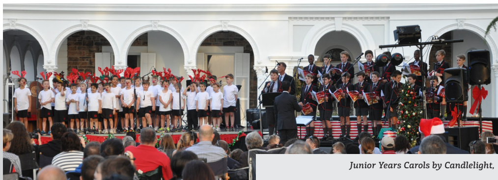
Junior Years Carols by Candlelight,