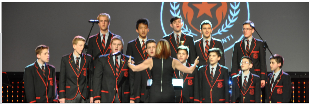
Senior Vocal. again proved to be one of the highlights of Presentation night!