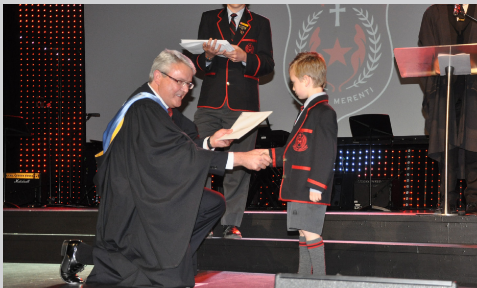
Presentation Night. a fantastic occasion to celebrate all aspects of the College big and small.

is the creation of the sum of its many parts. Its heritage and its future are shaped by you. Never forget the power you have to contribute to the shaping of our beloved College. Your fingerprint has an impact and will never be forgotten nor erased.