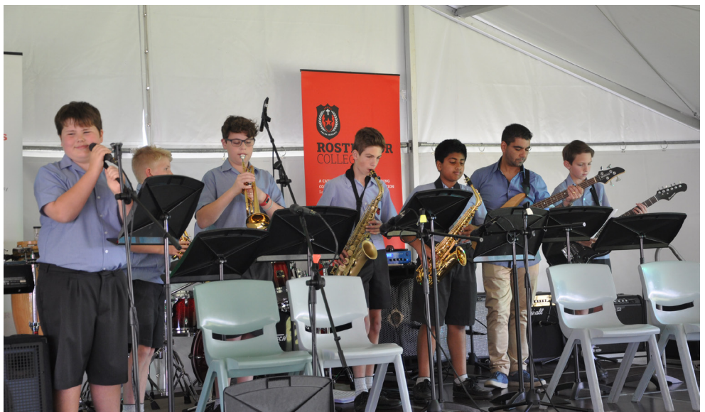
Junior Years' music program was showcased in its entirety as a part of the Spring Fair entertainment

It was also wonderful to meet many of our new parents for 2017 as well as parents making the transition from our Junior Years last Wednesday at our Information Evening.