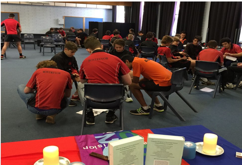
Group Work Students worked in small groups to build not only trust but bond with each other

Thank you to all the senior boys for their hard work.