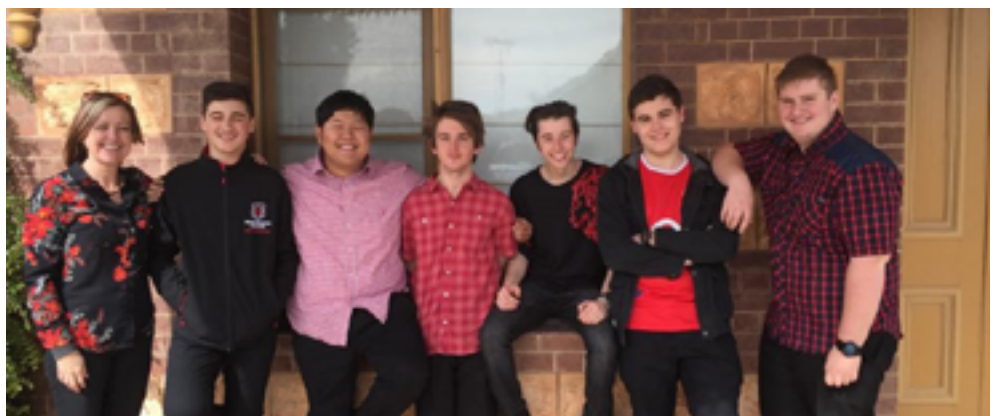
Right - Another strong showing from the Senior Rock band who finished 2nd in this edition of the Eisteddfod having won the competition previously.