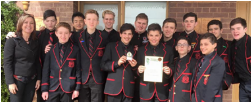
Above - The Senior Vocal Group who finished 3rd in their competition performing 'River of Dreams' and 'Ode to a Freeloader'.

Hosted by the Parent Music Support Group