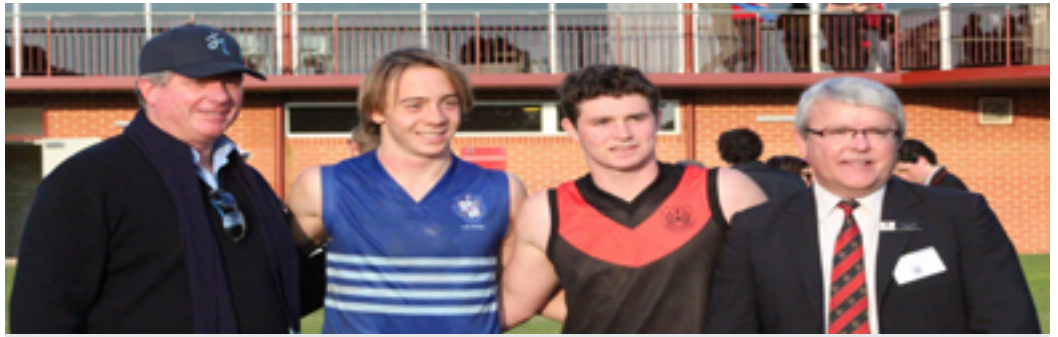
First XVIII Football, Principals and Captains together after the game on Saturday.