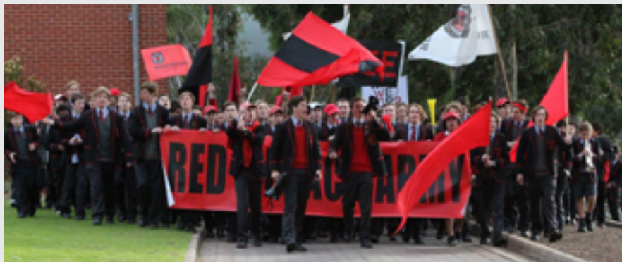
STUDENT SUPPORTER GROUP march down to the main oval for First XI game.