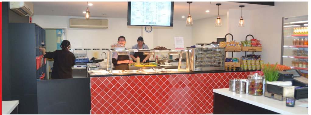
R-12 Canteen, the new-look canteen after its holiday makeover.