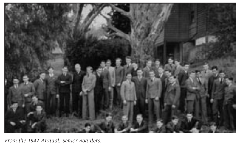
The photo is taken in the Valley looking SSW. The building in the back ground is the back of the old Chapel cum theatre and the entrance to the underground changerooms is evident.