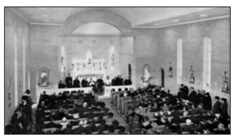
From the 1939 Annual: The interior of the new Chapel at the Opening Ceremony