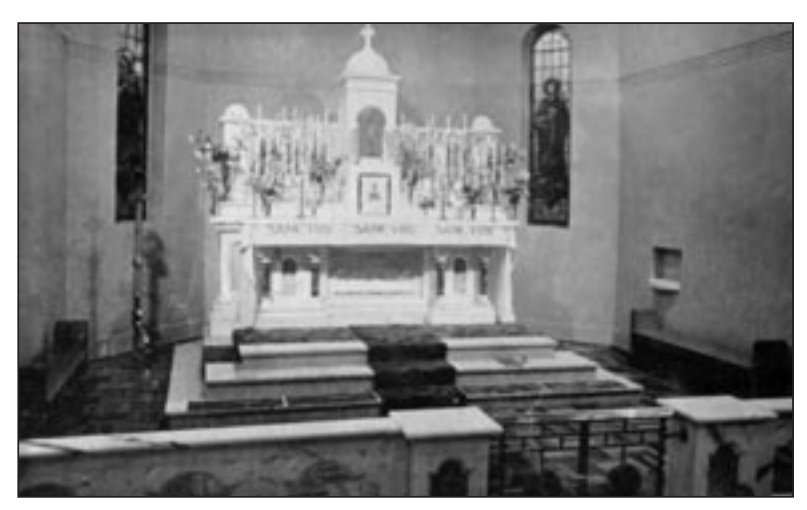
From the 1940 Annual: The Rostrevor Chapel Altar

The Rostrevor Chapel received major renovations in 1983 at which time the altar rails and gates were removed, the