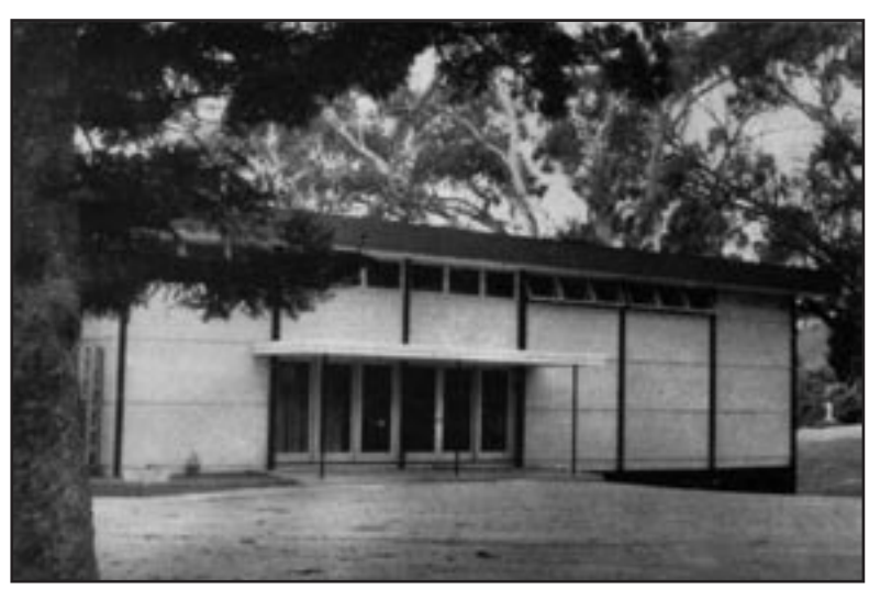
From the 1967 Annual: The exterior of the renovated theatre (original Chapel)