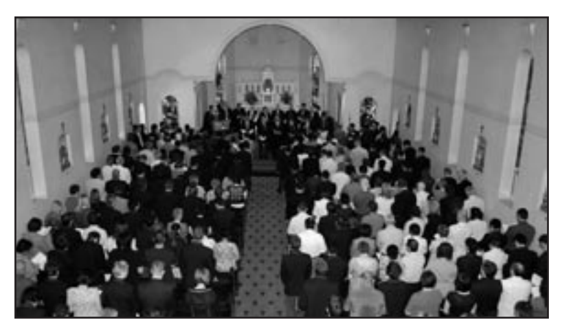
The interior of the Chapel during the 2008 Year 12 Graduation Ceremony