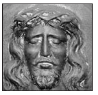
The detail of the Ecce homo on the original altar gates. The gates were retained in storage after the 1983 Chapel renovation