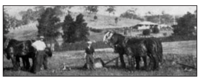
From the 1926 Annual: First Day on the New Oval

The College was home to a number of horses over the years. The 1949 Annual depicts a draught horse being ridden and used to tow a cart. From the captions of the time there is no