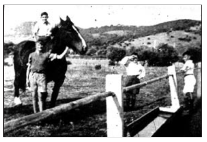
From the 1949 Annual

boarder's interests in equine matters extended to include the thoroughbred industry. A recently related story, reflecting on the late 1950s, inferred that the interest in horses was so great that a book was run by an enterprising boarder on the Melbourne Cup – and the Headmaster of the time outlayed threepence - and collected! One would assume such incidents were isolated ones but there may be some connection with this and the high percentage of old scholars who have taken up the occupation of bookmaker over the years. All in all, a tribute to the high level of numeracy attained for the students by the College staff.