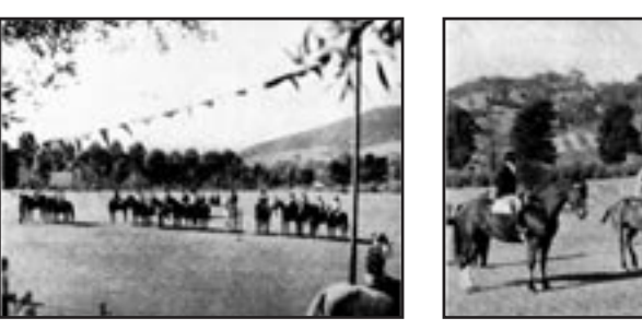
From the 1943 Annual: Scenes at the Rostrevor Gymkhana