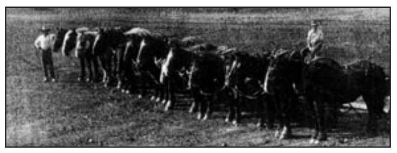
From the 1927 Annual: Teams on New Oval