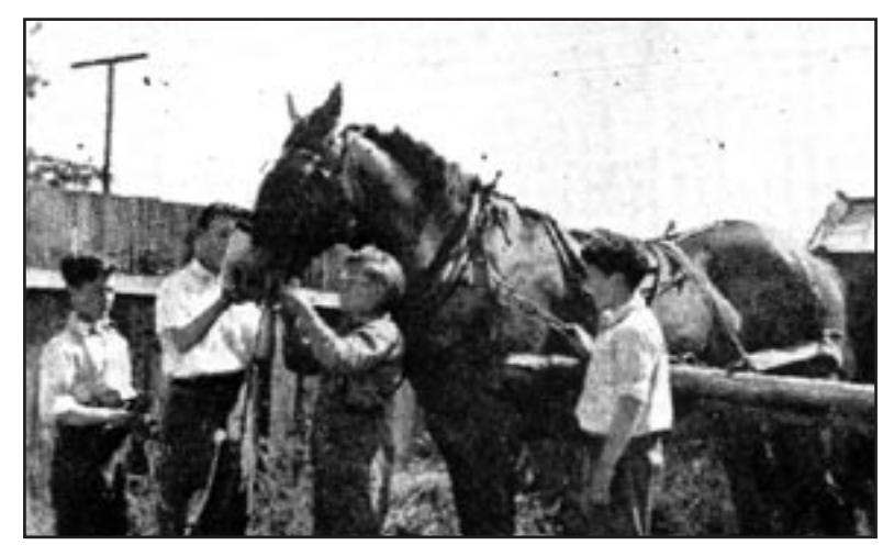
From the 1949 Annual