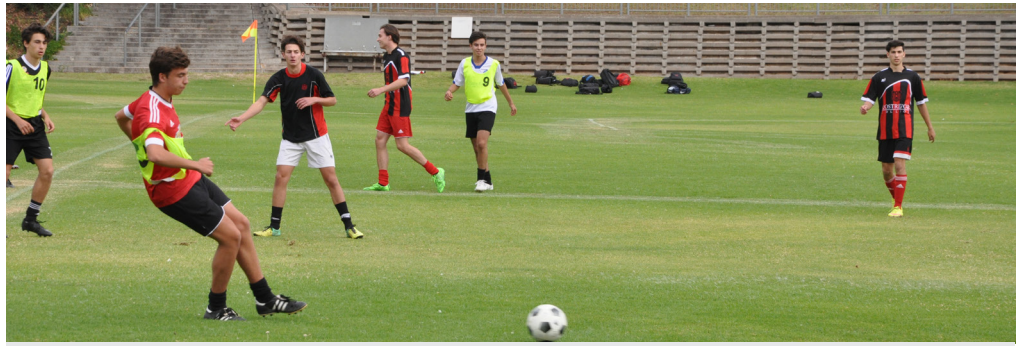
1st XI Soccer, trial game during this weeks training session