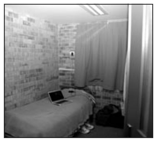
The new extension increased the capacity of Duggan House to 100 beds.