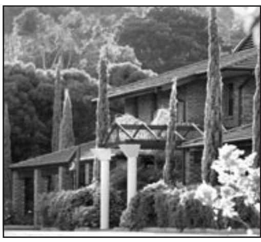
A magnificent modern boarding house was erected on the old tennis courts site. Duggan House, as it was appropriately named, provided excellent accommodation for eighty boarders and live-in staff, ensuring that once again Rostrevor was complete.