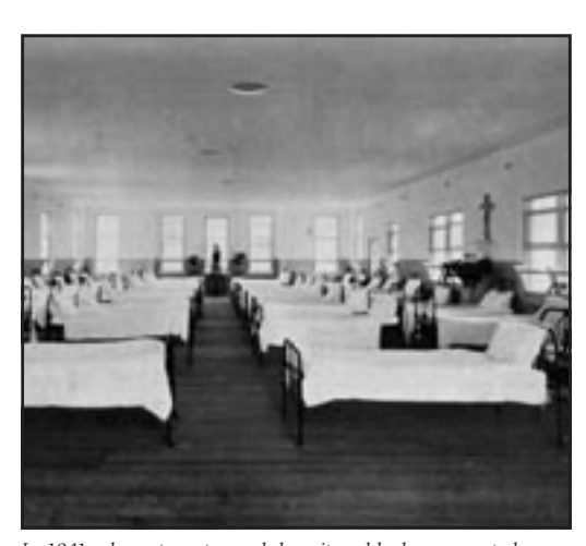
In 1941 a large two-storeyed dormitory block was erected on the northern side of Rostrevor House. The upstairs Senior Dormitory