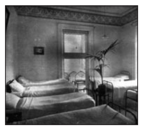
Boarding accommodation was distributed around five large bedrooms in Rostrevor House. This is the Junior Dormitory in 1923