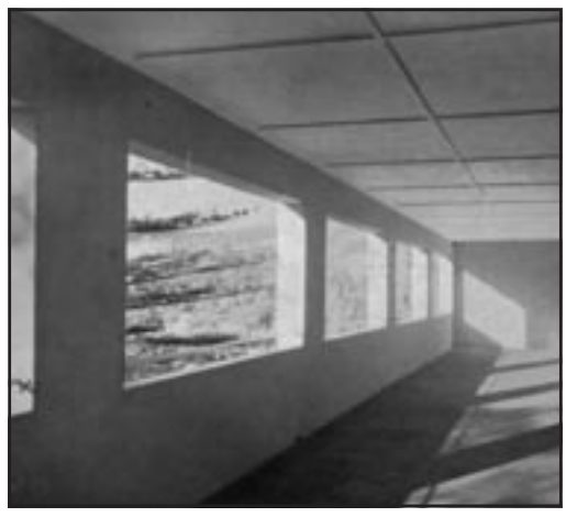
In 1941 a large two-storeyed dormitory block was erected on the northern side of Rostrevor House. The upstairs verandah.