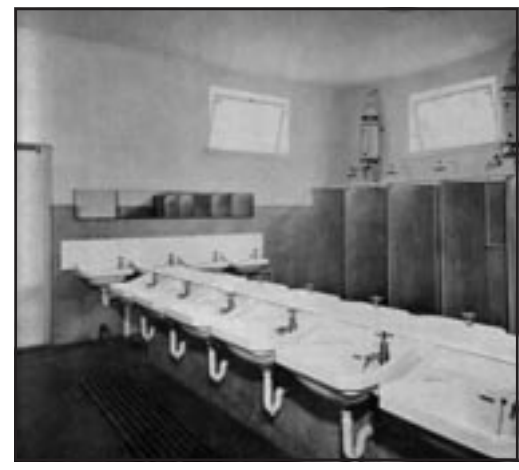
In 1941 a large two-storeyed dormitory block was erected on the northern side of Rostrevor House. The upstairs ablutions