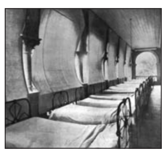
The northern balcony of Rostrevor House (Winter)