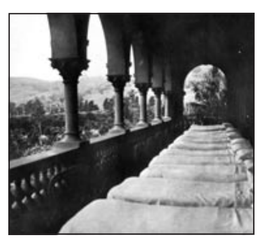
The northern balcony of Rostrevor House (Summer)

large two-storeyed dormitory block was erected on the northern side of Rostrevor House. On each floor was a traditional large room containing forty beds, with ten more on the balcony, a locker room and rooms for the supervising Brothers. The situation remained the same for the next eighteen years, although the old chapel was converted to a temporary dormitory when boarding numbers grew in Brother Mogg's time in the early 1950's to a record 215. A great step forward in the provision of suitable boarding accommodation