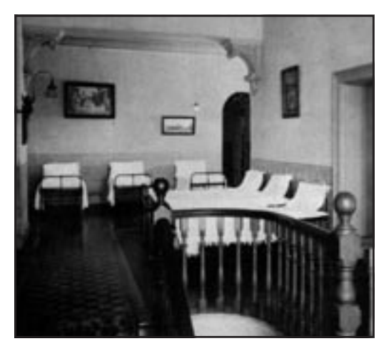
Boarding accommodation was distributed around five large bedrooms in Rostrevor House. This is the upstairs landing in the late 1930s