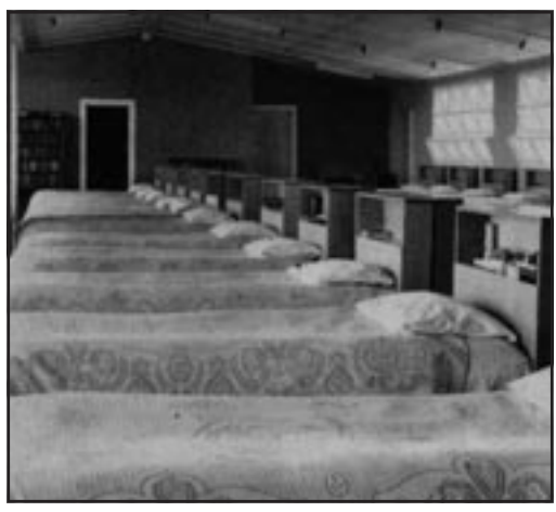
The Year 8 Dormitory in the Rice Wing 1961

The opening of the new section is planned to coincide with the return of the ROCA boarders function, The Boarders' and Scraggs' Banquet on Friday 6 November. See advertisements in this edition for more detail.