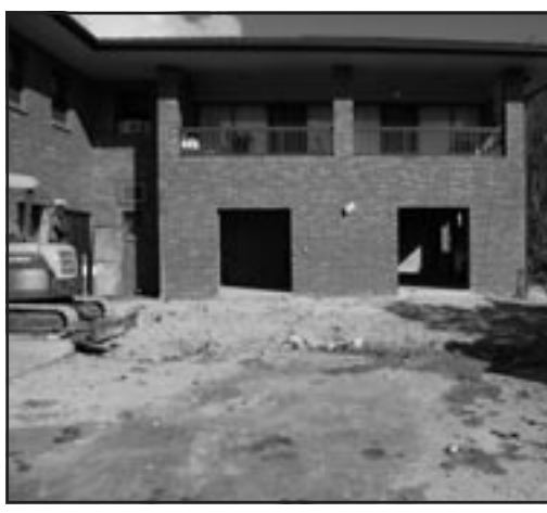
The site for the new Duggan House extension, August 2008.