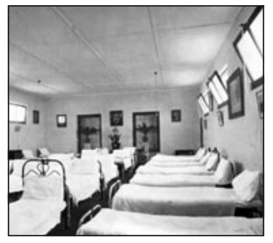
A fine Junior Dormitory was added in 1935.