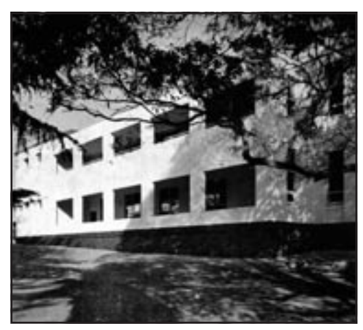
In 1941 a large two-storeyed dormitory block was erected on the northern side of Rostrevor House. The northern exterior of the new Dormitory