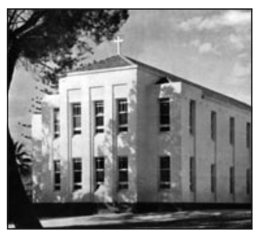
In 1941 a large two-storeyed dormitory block was erected on the northern side of Rostrevor House.