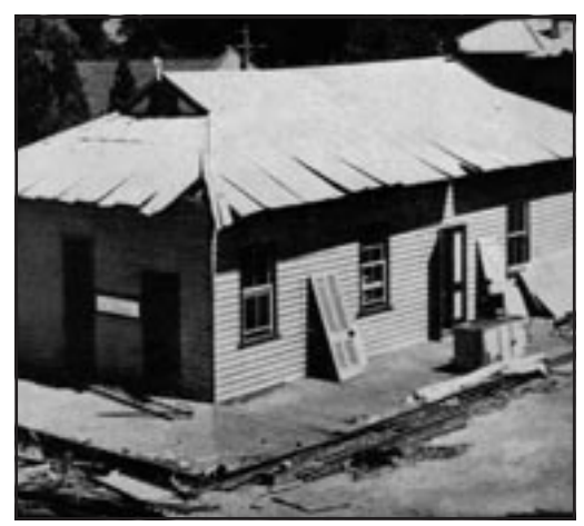
The demolition of the Bungalow in 1961