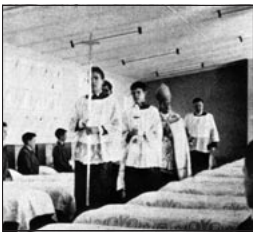
Archbishop Beovich blesses the new dormitories in 1961