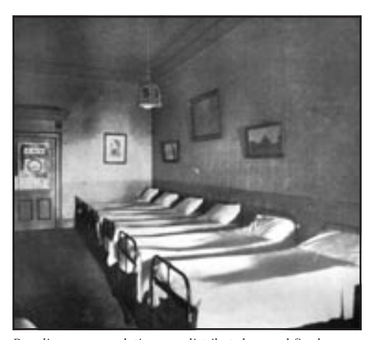
Boarding accommodation was distributed around five large bedrooms in Rostrevor House. The Small Boys Dormitory, 1923