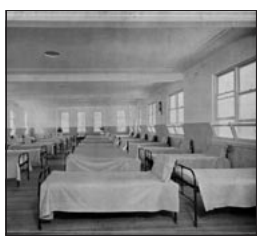
In 1941 a large two-storeyed dormitory block was erected on the northern side of Rostrevor House. The Intermediate Dormitory